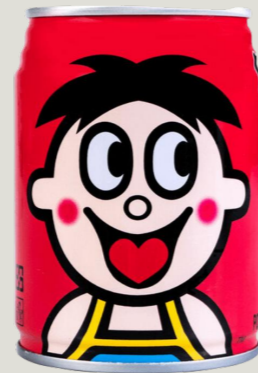
Wang Wang Milk Drink 旺仔牛奶 $2.99