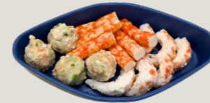
Plant Based Konjac Sticks Platter 素食拼盘