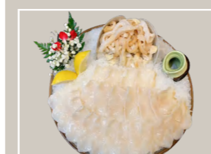
Geoduck 49.99/EA 象拔蚌 About 1.5lb 74.99/EA