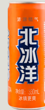
Tangerine Flavored Soda 北冰洋汽水 $2.99