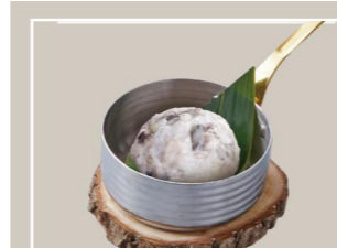
The Dolar Shop Shrimp Pate 6.99 豆捞大虾仁滑 14.99