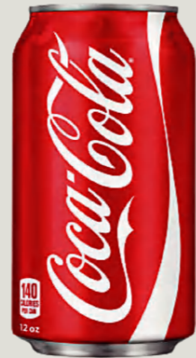
Coca Cola 可口可乐 $2.99