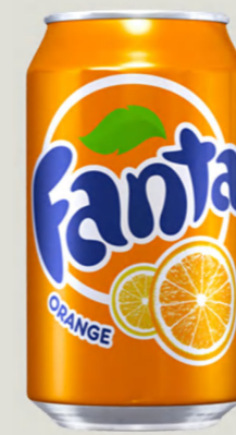
Fanta 芬达 $2.99