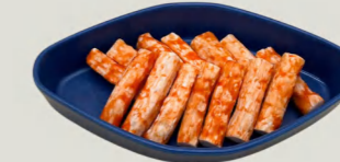
Plant Based Konjac Sticks (Crab Flavor) 全素蟹柳