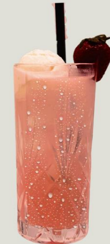
Pink Strawberry Float 粉红草莓泡泡 $3.99