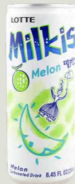
Milkis Melon Soda Milkis 甜瓜口味 $2.99