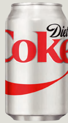
Diet Coke 无糖可乐 $2.99