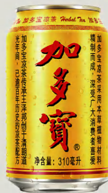
Sweet Herbal Tea 加多宝 $2.99