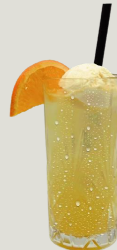
Passion Fruit Float 黄色百香果泡泡 $3.99