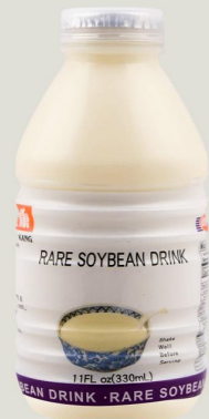
Rare Soybean Drink 正康豆奶 $3.99