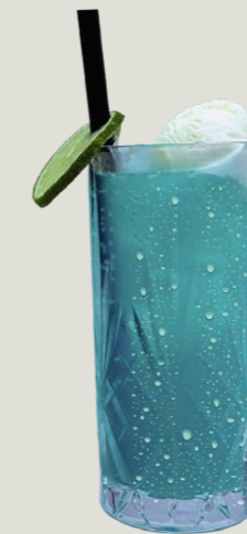
Virgin Orange Blue Curacao Float 蓝橙泡泡 $3.99