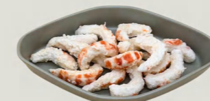
Plant Based Konjac Sticks (Shrimp Flavor) 全素斑节虾