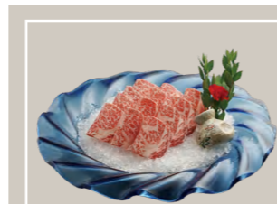
A5 Miyazaki Wagyu 39.99 A5官崎和牛 79.99

Order AYCE to unlock special discount prices on selected a la carte items. AYCE的客人, 可享受额外加点菜品的特价