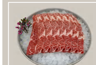
Grand Cru Wagyu Thick Cut 21.99 至尊霜降和牛 42.99