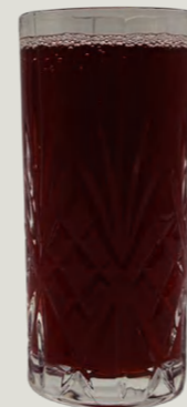
Granny Recipe Plum Juice 古法酸梅汤 $2.99