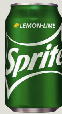
Sprite 雪碧 $2.99