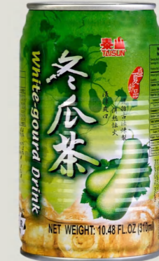
White-gourd Drink 冬瓜茶 $2.99