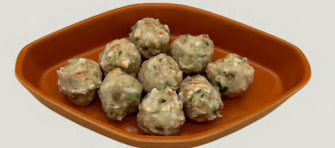
Plant Based Konjac Balls (Mixed Vegetable Flavor) 全素什锦丸